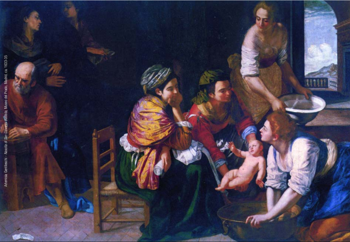
Artemisia Gentileschi - Nascita di San Giovanni Battista, Museo del Prado, Madrid, ca. 1633-35